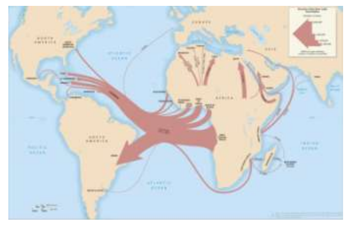
The Slave Trade, from the Legacies of British Slave-ownership exhibition, 'Slave-owners of Bloomsbury'.

The colonial slave system was structured around the 'triangular trade' that saw British manufactured goods exchanged for slaves along the West Africa coast, to be shipped to the Caribbean where tropical cash crops were loaded for sale in Britain. Between the 15<sup>th</sup> and 19<sup>th</sup> centuries when the Atlantic slave trade persisted it is estimated that at least 12.5 million people were shipped by European nations from Africa to the Americas - at least 1.7 million of whom died during the 'Middle Passage', as the