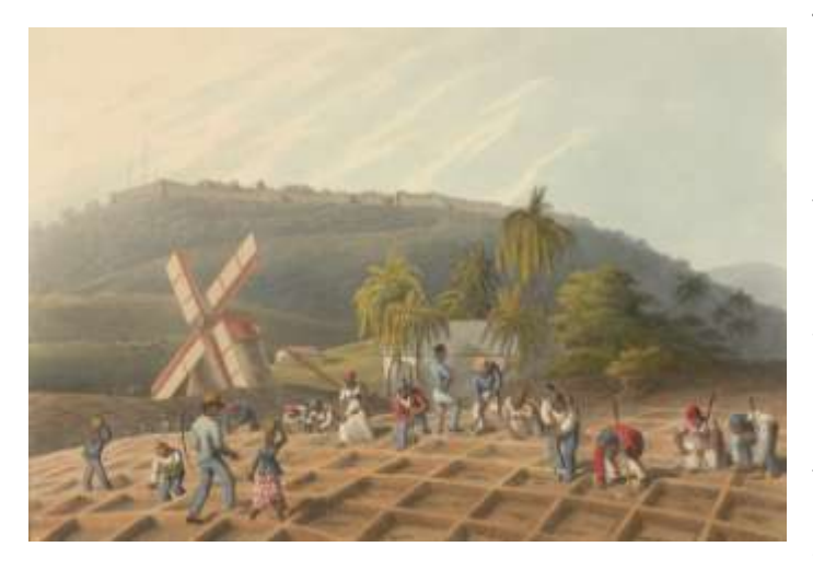
'Planting the Sugar Cane, Antigua', from William Clark, Ten Views in the Island of Antigua, 1823 (click on the image to go to BL's Digital Galleries for more information).

The efforts of this group became increasingly defensive during the late eighteenth century as the public campaign for the abolition of the slave trade gathered momentum. А combination of falling sugar profits, exacerbated by the protracted period of war from 1776 until 1815, and public resentment at the incongruity between rising sugar prices on the one hand and the perceived luxuriant wealth of returning planters on the other, left the West Indian lobby increasingly beleaguered. A hard fought rear guard action delayed the abolition of the slave trade during the 1790s and won a few