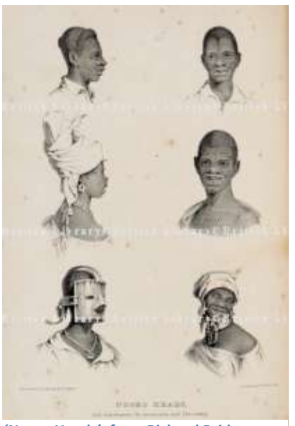
'Negro Heads', from Richard Bridgens, West India Scenery, with illustrations of negro character (c.1836). (Click on the image to go to BL's Digital collections for more information).

population, it certainly did not create the conditions depicted by many artists and travel writers sympathetic to the slave-owners, who portrayed life on a Caribbean plantation as idyllic. Allusions to the violence and repression imposed upon slaves emerged even in sympathetic accounts of the slave system, as captured by the illustration from Richard Bridgens' 1830s publication, West India Scenery, with illustrations of negro character, the process of making sugar, from sketches taken during a voyage to, and residence of seven years in, the island of Trinidad. The uncomfortable juxtaposition of smiling 'negro heads' above depictions of slaves wearing a mask of metal - either as punishment or to prevent the practice of 'dirt eating' - and an iron collar, highlights the complacent indifference to violence that underpinned the strategies of racialised "othering" deployed to endorse slavery. Even after 1807 the West Indian lobby continued to defend their interests in Britain in a manner that defied any naïve hopes that Caribbean slavery would simply fade away. Abolition did not destroy the sugar trade nor did it represent the final acknowledgement from the British government that the Caribbean had ceased to be economically