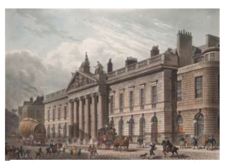
View of East India House, Leadenhall Street, London, 1817 (click on the image to go to BL's digital galleries for more information).

the century the British presence in India was transformed from commercial traders into 'conquerors and rulers', whose power 'was to engulf the Indian subcontinent.'<sup>9</sup> Victory at the Battle of Plassey in 1757 set in motion a period of aggressive expansion that led in 1765 to the British assuming direct rule over the province of Bengal. This acquisition alone extended EIC control over twenty million people, provided £3 million a year in revenue and proved the catalyst for similarly far-reaching expansion in southern India around Madras (present-day Chennai) and in the west from Bombay (present-day Mumbai).<sup>10</sup> In all three 'Presidencies' – Bengal, Madras and Bombay – EIC armies fought both local rulers and European rivals in an attempt to secure British interests.