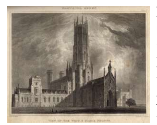
Fonthill Abbey, built by William Thomas Beckford (click on image to go to BL's digital galleries for more information)