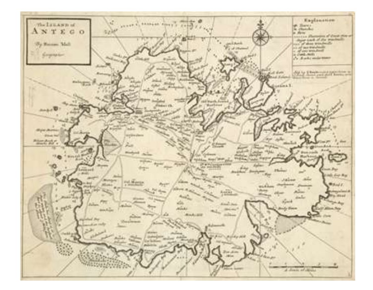
Map of the island of Antigua (c.1732) by Herman Moll (click on the image to go to BL's Digital Galleries for more information).

Where historians have looked specifically at the Martins they have tended to focus overwhelmingly upon their Caribbean context.<sup>28</sup> This has revealed important new understandings of how family relations were structured across the Atlantic world, as well as giving an insight into life on their Green Castle plantation. However, rarely has the family been situated in a broader global context that considers how connections between the Caribbean, Britain and India were constructed, sustained and deployed to further the family's prospects. Inevitably, using the archive to explore the dynamics of family life across three continents and through multiple generations is not straightforward. Nevertheless, the richness of the British Library's collections makes it possible to begin to unravel this fascinating and intricate global family history.